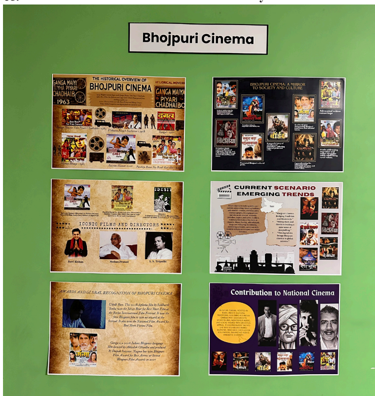
Posters on Bhojpuri Cinema