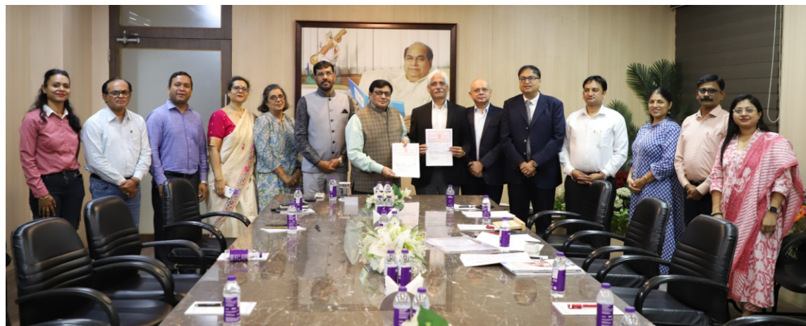
A landmark strategic partnership was reached with IBM India to revolutionize tech education at DYPIU.

DY Patil International University (DYPIU) has announced a landmark strategic partnership with IBM India aimed at revolutionizing technology education at the institution. The collaboration will integrate IBM's cutting-edge Innovation Center for Education (ICE) programs into DYPIU's curriculum.