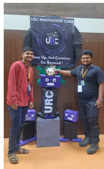
Going up and high