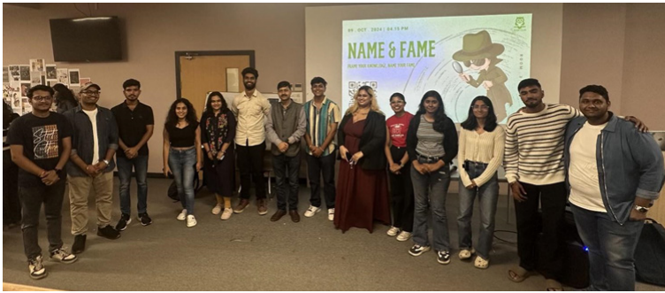
Name & Fame Event Celebrates Knowledge Sharing at DYPIU