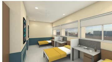
Creating a home away from home

The facilities will include an indoor sports complex, gym, mini shopping arcade, spacious dining hall, reading room, and a TV room.