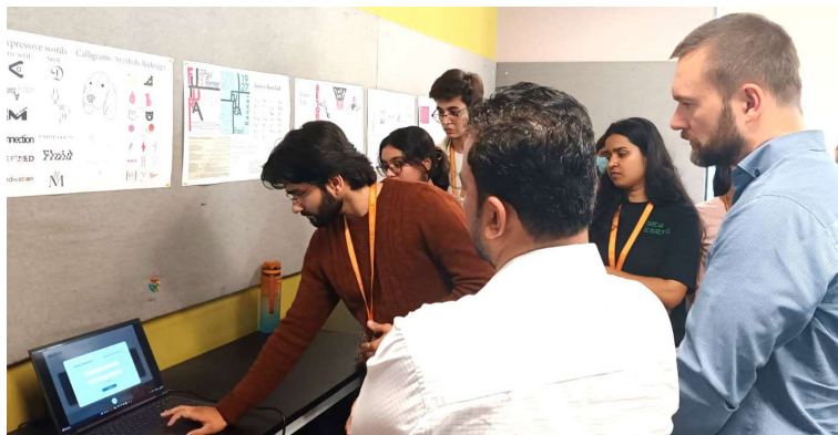
Inspecting the creativity of students

In a demonstration of creativity and forward-thinking, third and fourth-year students from the B Design program at D.Y. Patil International University showcased their projects in UI/UX and Graphic Design to a team of industry experts from Skoda Volkswagen.