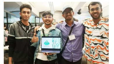
2nd Year B-Tech CSE Students