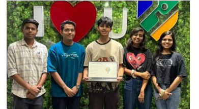
1st-year B-Tech Mechanical Engineering Students

DYPIU's 2nd-year B-Tech CSE and 1st-year B-Tech Mechanical Engineering students have reached the Smart India Hackathon Finals! With their fresh ideas and dedication to solving real-world problems, they have earned this chance. Wishing the future innovators all the best on this exciting journey!