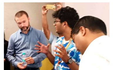
In deep discussion