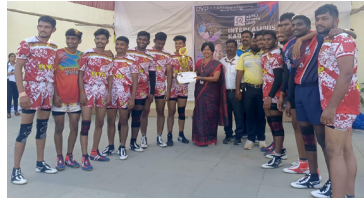
Team COE celebrates their victory

show our skills," she said with enthusiasm. She expressed that teamwork and trust within her team played an important role in their victory, saying, "Our determination was unbreakable, and this win is a result of everyone's efforts."