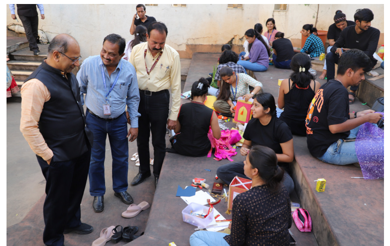
Lanterns on display made by students

The competition brought smiles, excitement, and a meaningful message of celebrating Diwali with eco-friendly practices. Trophies were awarded to all winners, and e-cer-