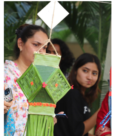
Lighting up the world