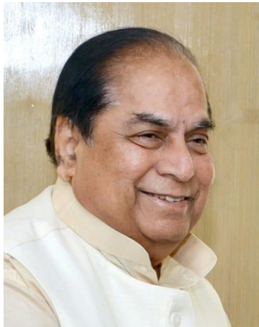
Dr. Dnyandeo Yashwantrao Patil

ON October 22, we celebrated the birthday of Dr. D.Y. Patil, a prominent figure in education, healthcare, and philanthropy in India. He is former governor of Bihar and Tripura. Born in 1935 in Kolhapur. Dr. Patil earned his medical degree from Grant Medical College, Mumbai.