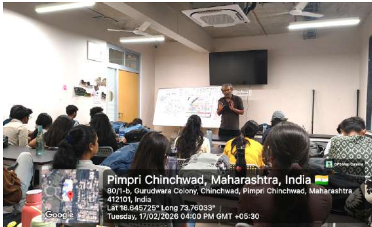
Pimpri Chinchwad, Maharashtra, India 80/1-b, Gurudwara Colony, Chinchwad, Pimpri Chinchwad, Maharashtra 412101, India Lat 18.645725° Long 73.76033° Tuesday, 17/02/2026 04:00 PM GMT +05:30

The School of Design at D.Y. Patil International University hosted a two-day workshop on Storytelling and Visual Sequencing on February 17th and 18th, 2026, bringing together first-year B.Des students for an immersive dive into the art of visual narrative.